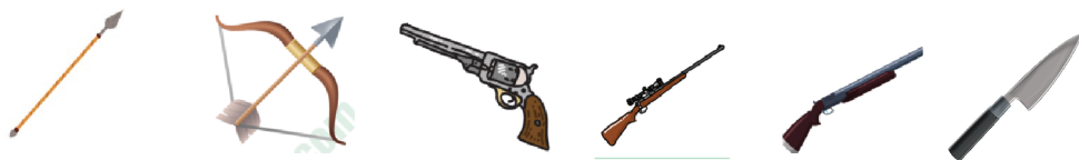
Spear Bow & arrow Revolver Rifle Shotgun Knife